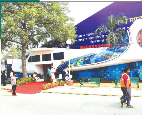
Indigeonously Built Aircraft VT-NMD.