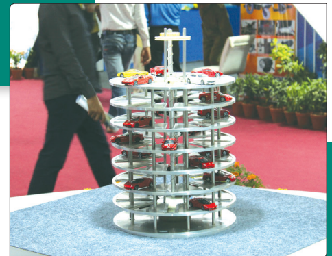
'SCOUT' The Smart Parking Solution (Automated Multilevel Mechanical Parking System).